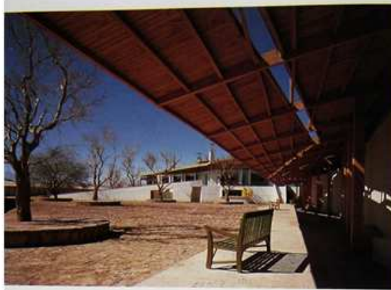
ABOVE AND OPPOSITE The architect extended the copper and wood roof deeply into the central plaza to make shady patios in front of each guest room. Cutouts in the roof system allow for interesting plays of shadow and light on the walls and grounds.

2000 ROCKPORT PUBLISHERS, INC GLOUCESTER, USA