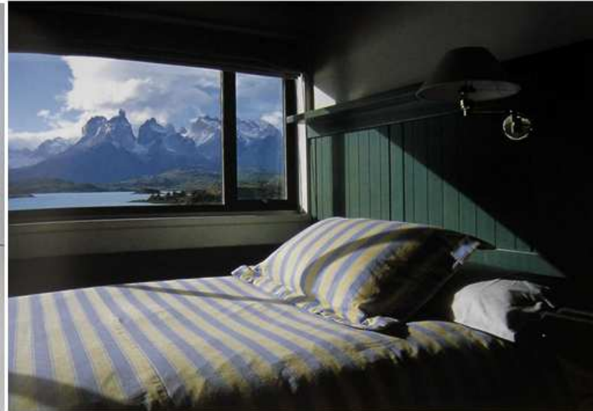
OPPOSITE AND ABOVE This view of the hotel's secondary structure, the lakeshore boathouse, and a view from a guest room, puts the structure into perspective: it lies in a vast, powerful natural landscape dominated by the wild peaks of the Torres del Paine.

At a glance, it hardly seems possible that the main building rises four stories, so intently does it cling to its gently sloping