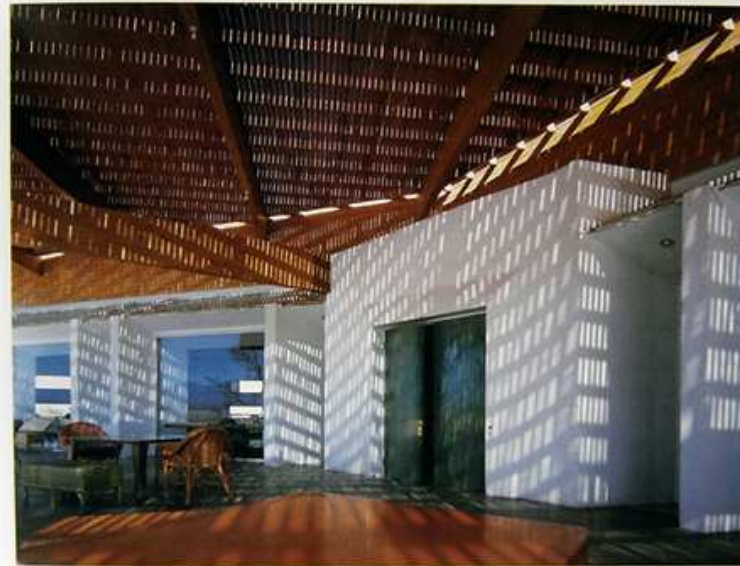
ABOVE AND OPPOSITE The lobby bar features custom-designed outdoor furniture stained in seven warm, muted colors. The lounge spills onto a triple-shaded terrace. Glass walls frame views of volcanic cones in the distance. PAGES 84-85 sheltered by spare, open pavilions, blue and gold cobalt saunas and bathhouses adjoin the hotel's several swimming pools. Paired against the salt curves and colors of the desert, mountains, and sky and reflected in the pool's water, these simple, geometrically sculpting forms take on a monumental presence.