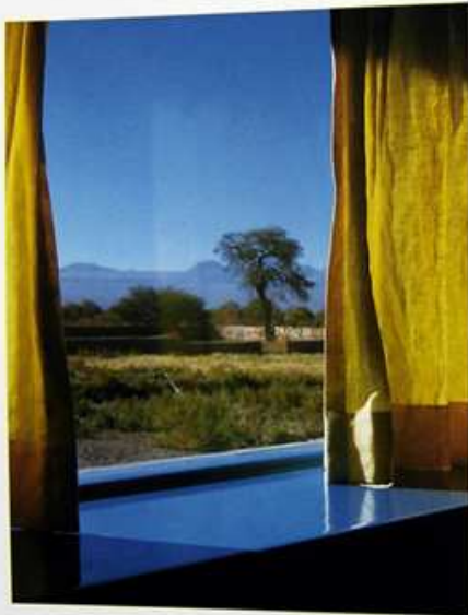
ABOVE Blue and pale gold window treatments frame a view of the oasis, with the grasses and sky inspiring the palette. OPPOSITE The architect found inspiration for the guest-room palette in the colors of the desert and the sky, and the oasis. The interiors display a sophisticated sense of style, enhanced by the use of local and regional crafts and furnishings.

2000 ROCKPORT PUBLISHERS, INC GLOUCESTER, USA