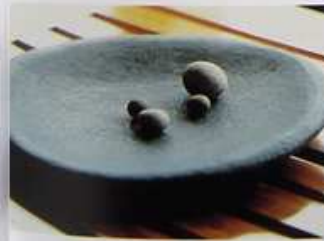
OPPOSITE The bathhouse contains a skylighted heated swimming pool lined with state decks and windows offering magnificent river and mountain views. LEFT The ceramic pieces and other artworks exemplify the designers' commitment to the folk-art and handcraft traditions of Chile. ABOVE This dining room was built to show off the view.