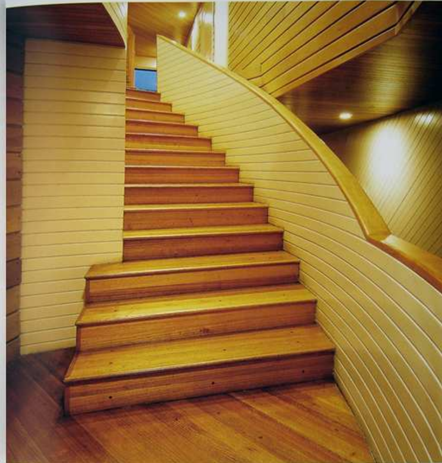
OPPOSITE TOP AND BOTTOM Floor-to-ceiling dividers, slanting walls, multiple colors and textures of wood finishes, and diagonally shifting ceiling heights dynamically divide the lounge into intimate gathering spaces. The furnishings, fixtures, and decorative accessories offer a pleasing mix of casual comfort and contemporary high style. ABOVE With a palette limited to wood in a narrow range of natural finishes and shades of off-white, the architect creates a surprisingly lively interior by deftly interweaving rectilinear lines and planes with sharp angles, the occasional curve, and an abundance of well-placed windows. Note how the staircase echoes the angle of the window.